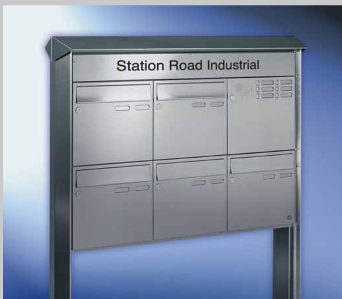
Fig. 3/3 Box format 370 x 330 x 145 mm, with RS50 and RSA , 2nd name plate, inscription box, V4A stainless steel PRISMA casing and frame. Letter plates 335 x 50 mm.