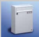
Box: 260 x 330 x 100 mm Letter plate 230 x 33 mm