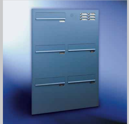
Fig. 5/2 Box format 370 x 330 x 145 mm, with RS50 , 24 mm steel front plate, with thermal break for mounting in door profile, with RSA . Letter plates 335 x 50 mm.