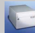
Box: 300 x 220 x 385 mm Letter plate 265 x 33 mm EN 13724