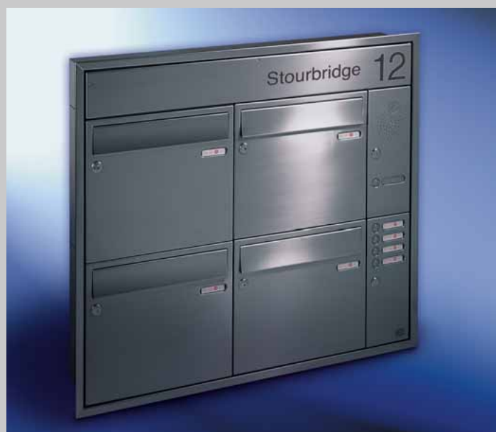
Fig. 3/4 Box format 370 x 330 x 145 mm, with RS50 and RSA , inscription box, V4A stainless steel angular plaster frame. Letter plates 335 x 50 mm.