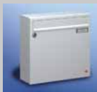
Box: 370 x 330 x 100 mm Letter plate 335 x 33 mm EN 13724