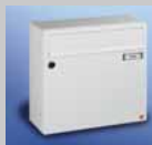
Box: 370 x 330 x 145 mm Letter plate 335 x 50 mm EN 13724 optional extra: RS50