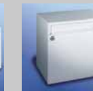
Box: 370 x 330 x 270 mm Letter plate 335 x 33 mm EN 13724