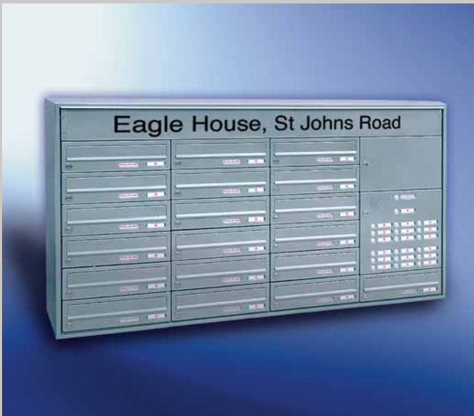
Fig. 4/1 Box format 370 x 110 x 270 mm, with RSA and 2nd name plate, inscription box and QUADRA casing. Letter plates 335 x 33 mm.

Select and combine any of the nine different basic formats and extra large boxes of the business series with angular or radius casing profiles. Sufficient space for the mail to lie in the bottom of the box. Because of the flat horizontal box design a large number of boxes can be fitted in a relatively small area.