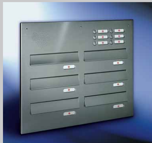
Fig. 5/4 Box format 300 x 110 x 265 - 410 mm, hinged V4A stainless steel front plate, with RSA . Letter plates 265 x 33 mm.