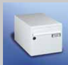
Box: 260 x 220 x 385 mm Letter plate 230 x 33 mm EN 13724