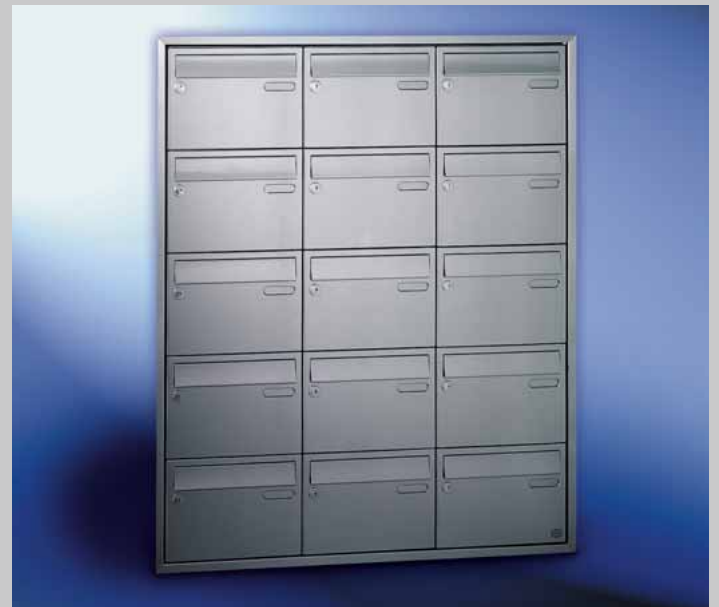
Fig. 4/2 Box format 300 x 220 x 385 mm, with RSA , V4A stainless steel angular plaster frame. Letter plates 265 x 33 mm.