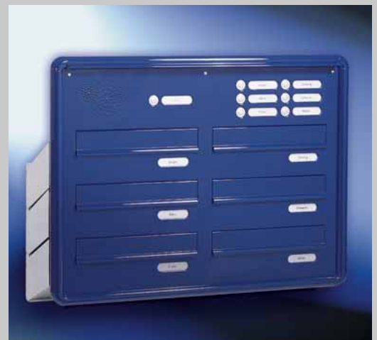
Fig. 5/5 Box format 300 x 110 x 265 - 410 mm, hinged steel front plate, with RSA and RS1001 aluminium radius-profile closing frame. Letter plates 265 x 33 mm.