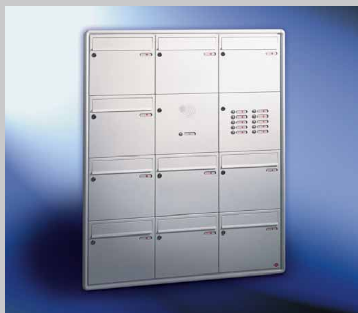
Fig. 3/2 Box format 370 x 330 x 145 mm, with RS50 and RSA , RS3000 aluminium radius-profile plaster frame. Letter plates 335 x 50 mm.