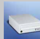
Box: 300 x 110 x 385 mm Letter plate 265 x 33 mm EN 13724