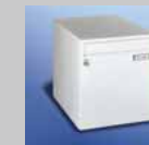
Box: 300 x 330 x 385 mm Letter plate 265 x 33 mm EN 13724