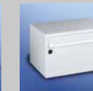
Box: 370 x 220 x 270 mm Letter plate 335 x 33 mm EN 13724