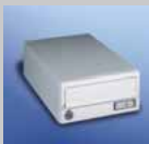
Box: 260 x 110 x 385 mm Letter plate 230 x 33 mm EN 13724