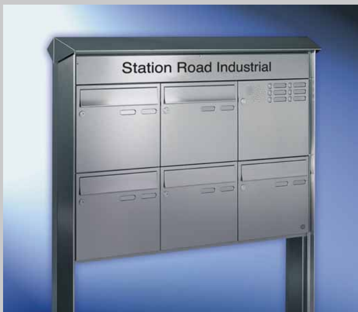
Fig. 3/3 Box format 370 x 330 x 145 mm, with RS50 and RSA , 2nd name plate, inscription box, V4A stainless steel PRISMA casing and frame. Letter plates 335 x 50 mm.