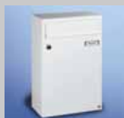
Box: 300 x 440 x 145 mm Letter plate 265 x 50 mm EN 13724 optional extra: RS50