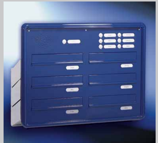
Fig. 5/5 Box format 300 x 110 x 265 - 410 mm, hinged steel front plate, with RSA and RS1001 aluminium radius-profile closing frame. Letter plates 265 x 33 mm.