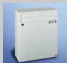
Box: 370 x 440 x 145 mm Letter plate 335 x 50 mm EN 13724 optional extra: RS50