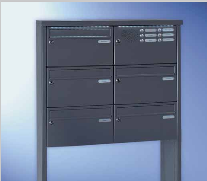
Fig. 4/3 Box format 370 x 220 x 270 mm, TETRO casing and frame fitted with lighting. Letter plates 335 x 33 mm.