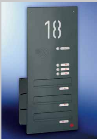
Fig. 5/3 Box format 300 x 110 x 265 - 410 mm, hinged steel front plate with RS1001 radius-profile closing frame with optional engraving. Letter plates 265 x 33 mm.