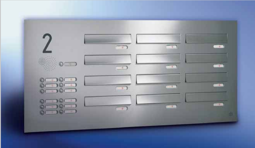
Fig. 5/1 Box format 300 x 110 x 385 mm, 24 mm front plate, with thermal break for mounting in door profile, with RSA , completely manufactured from V4A stainless steel. Letter plates 265 x 33 mm.

Units can be supplied for fixing to the existing glazing section or complete with their own glazing section. Steel or stainless steel front plates.