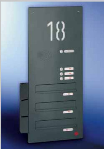
Fig. 5/3 Box format 300 x 110 x 265 - 410 mm, hinged steel front plate with RS1001 radius-profile closing frame with optional engraving. Letter plates 265 x 33 mm.