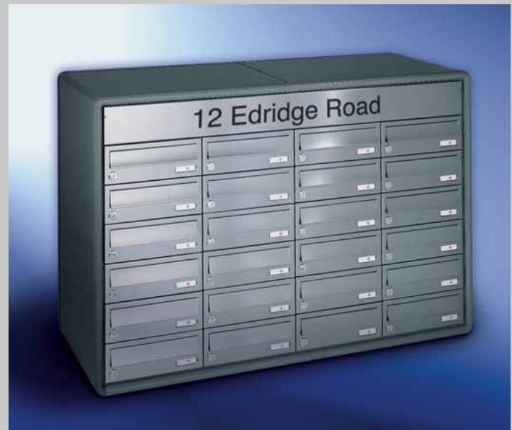
Fig. 4/4 Box format 300 x 110 x 385 mm, with RSA , inscription box and RS4000 radius aluminium casing. Letter plates 265 x 33 mm.