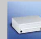
Box: 370 x 110 x 270 mm Letter plate 335 x 33 mm EN 13724