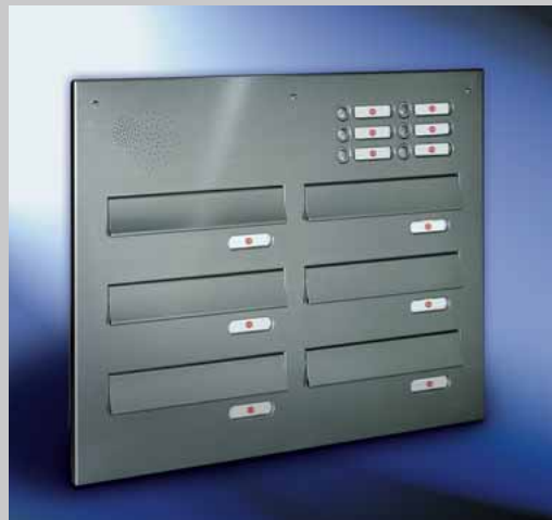
Fig. 5/4 Box format 300 x 110 x 265 - 410 mm, hinged V4A stainless steel front plate, with RSA . Letter plates 265 x 33 mm.