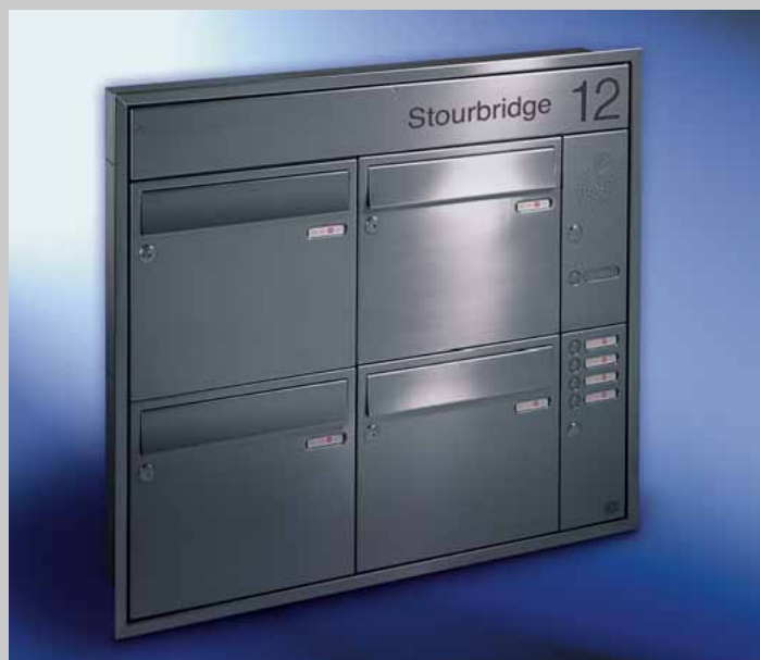
Fig. 3/4 Box format 370 x 330 x 145 mm, with RS50 and RSA , inscription box, V4A stainless steel angular plaster frame. Letter plates 335 x 50 mm.