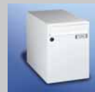
Box: 260 x 330 x 385 mm Letter plate 230 x 33 mm EN 13724